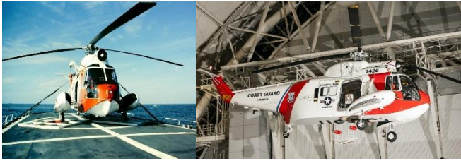
Left: CG1426 as it sits on the back of a Coast Guard Cutter in 1979.